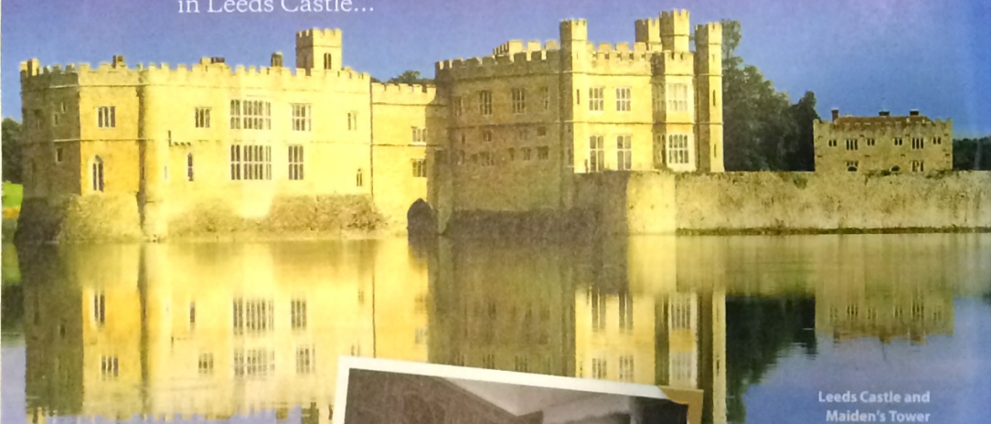
Leeds Castle and Maiden's Tower From left: The swimming pool at Leeds Castle; Lady Baillie's bedroom; the drawing room